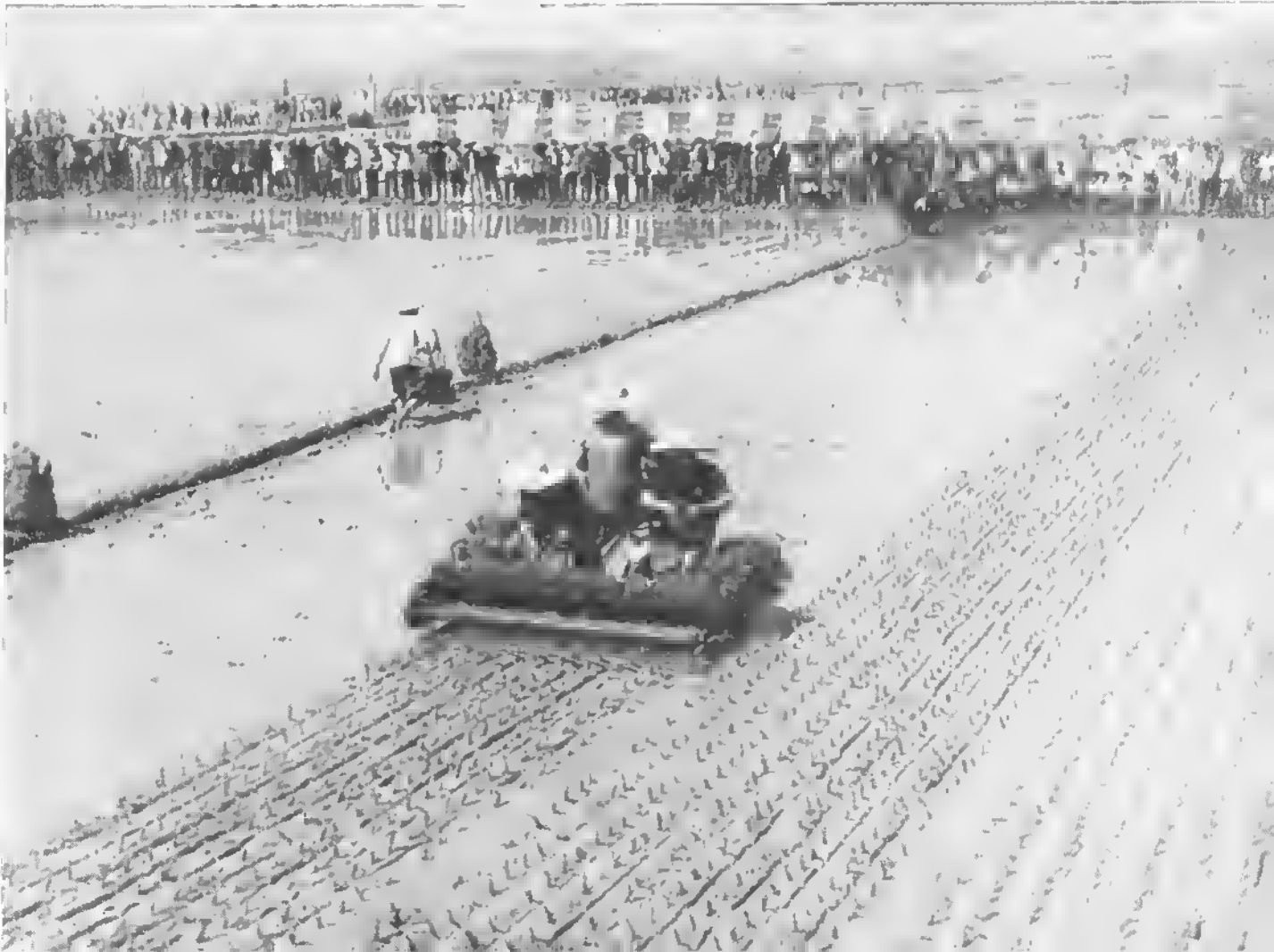
Demonstrating a new mechanized rice transplanter before representatives of poor and lower-middle peasants from every part of the country—Wamin county, Kwangsi.